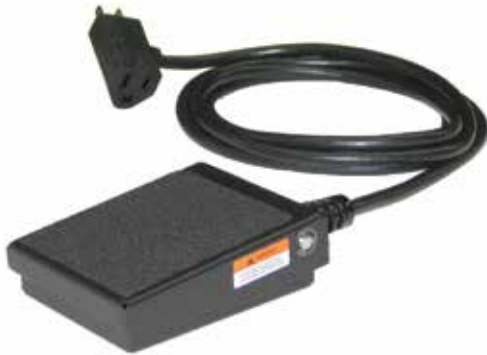
(cable with 3-pronged series connector shown)